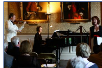
The musicians in full flow!